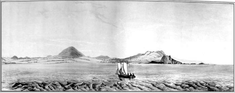
From Abel du Petit-Thouars' 1841 voyage of the Venus .

shore, or anywhere for that matter. And a few pages later, the Chola widow walks across the island on a morning. People have died trying to cross far shorter distances on Norfolk Isle. It usually takes a week or two for death to find them.